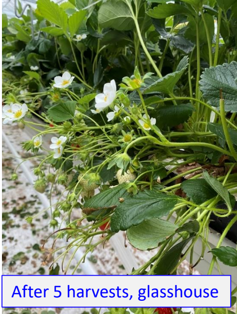
After 5 harvests, glasshouse