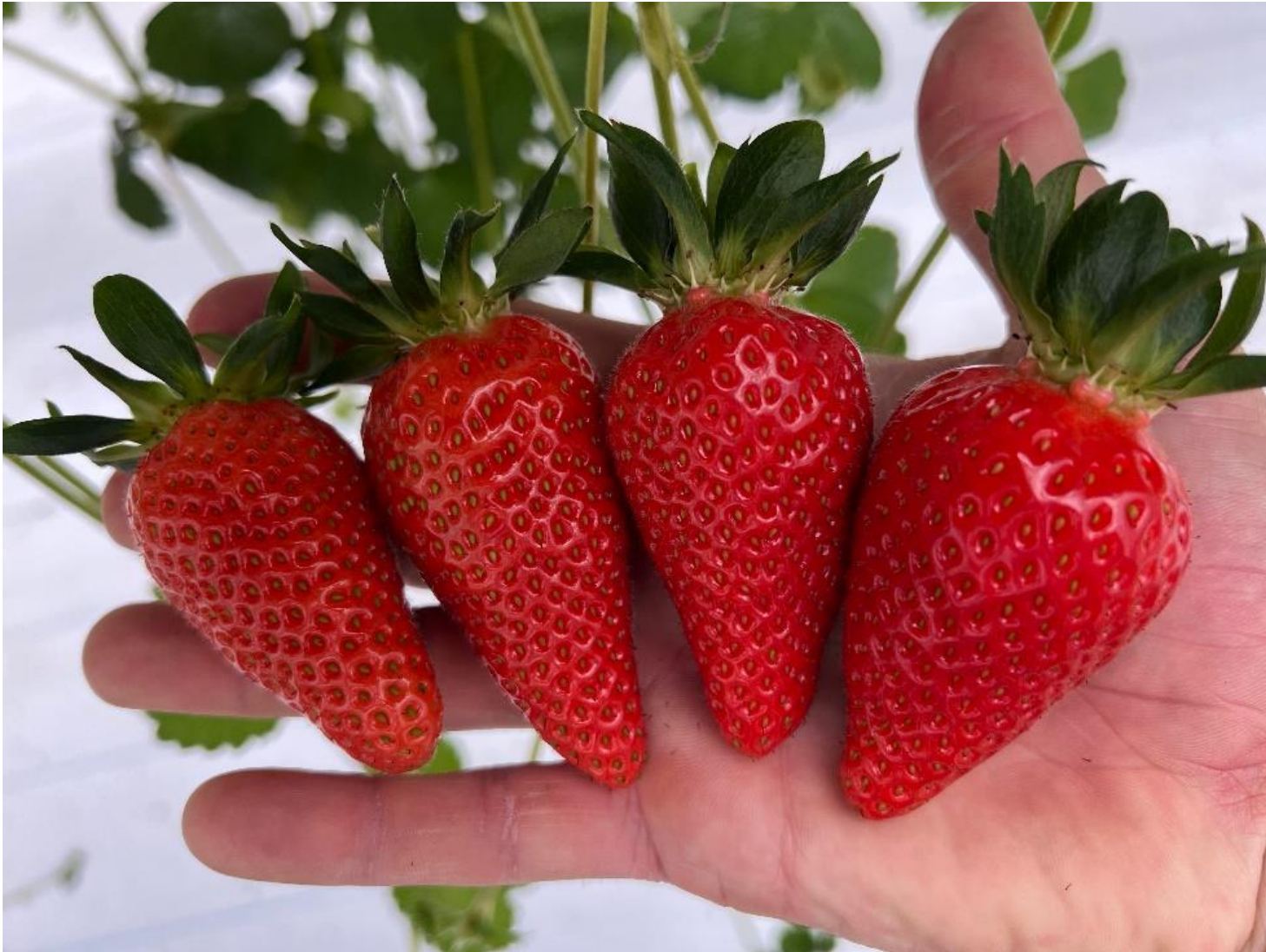
210130, favourite selection