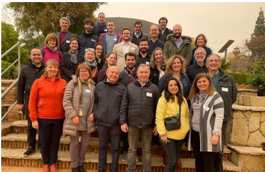
First Annual meeting Malaga, March 2022