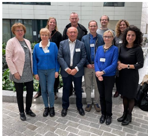
First Evaluation by the European Union, Brussels, Sept. 2022