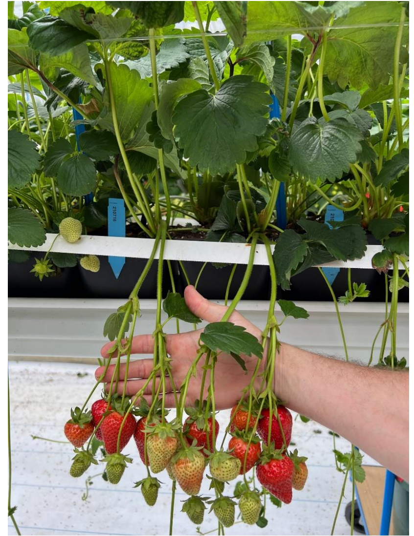
210713, favourite selection