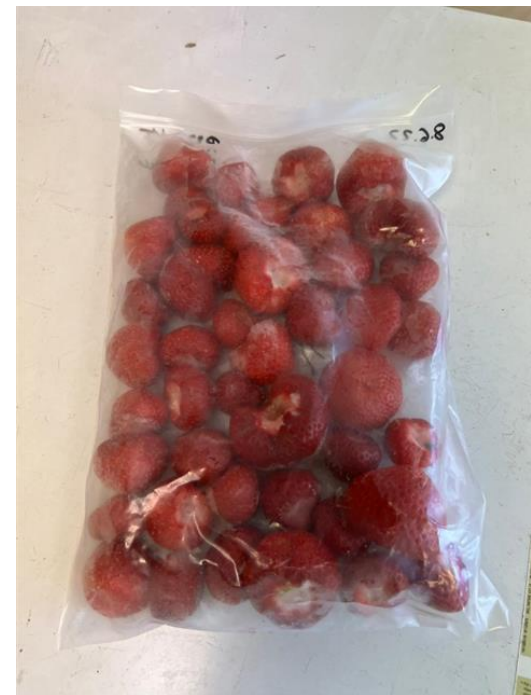
Hansabred fruit are analyzed for VOCs and NON-VOCs in Spain and Italy